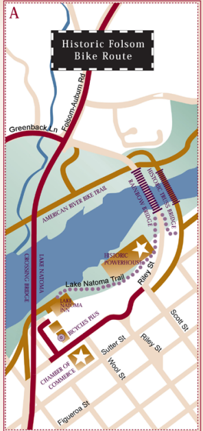
Historic Folsom Bike Route