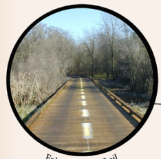
Folsom HBWC Trail

Prepared by City of Folsom Parks & Recreation Department 2000 0 2000 4000