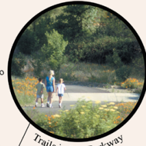
Trails in The Parkway

*Bike lane in south-west bound direction between Natoma Station and Blue Ravine